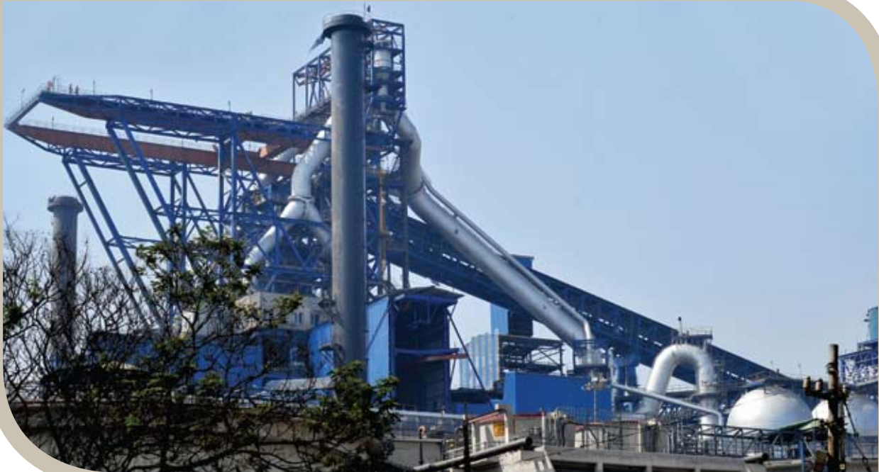
Brownfield expansion "I" Blast furnace, Jamshedpur, India

The 6 mtpa Pellet Plant will enable the Company to use extra-fine iron ore as the feed after beneficiation rather than scarce lumps, resulting in improved Blast Furnace productivity, due to increased percentage of agglomerate in the Blast Furnace burden. As mineral resources are scarce and exhaustible, the Company is continuously working to increase the life of its existing mines by improving productivity and enhancing its capabilities to mine and process inferior ores.