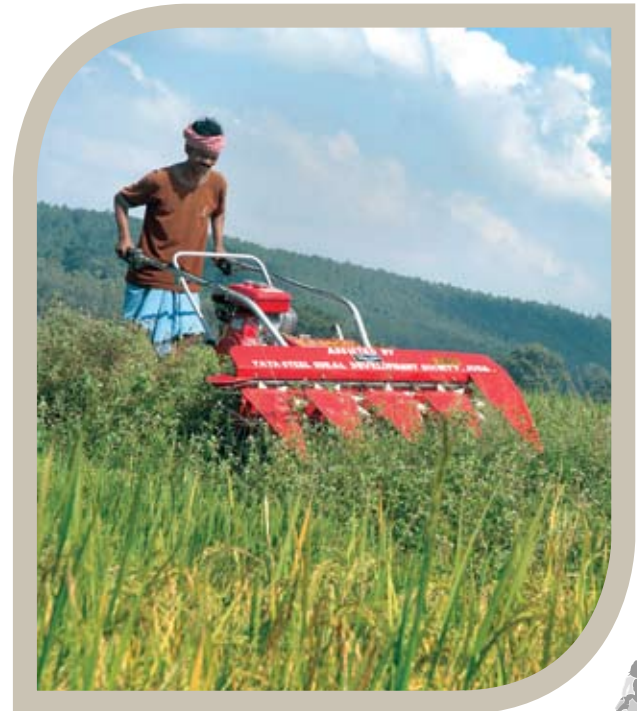
Tata Steel supplies agricultural equipment

The Agrico division has been in operation since 1923-24 and owns one of the oldest Tata brands to reach the Indian households–Tata Agrico. The product range includes Hoes, Sickles, Crowbars, Shovels, Pick Axes, Hammers and others. Tata Agrico has played a major role in developing agricultural implements which are much easier to use and provide better value to Indian farmers. The Agrico division of Tata Steel follows a unique model of not having its own manufacturing facilities but outsourcing its entire product range to external processing agents.