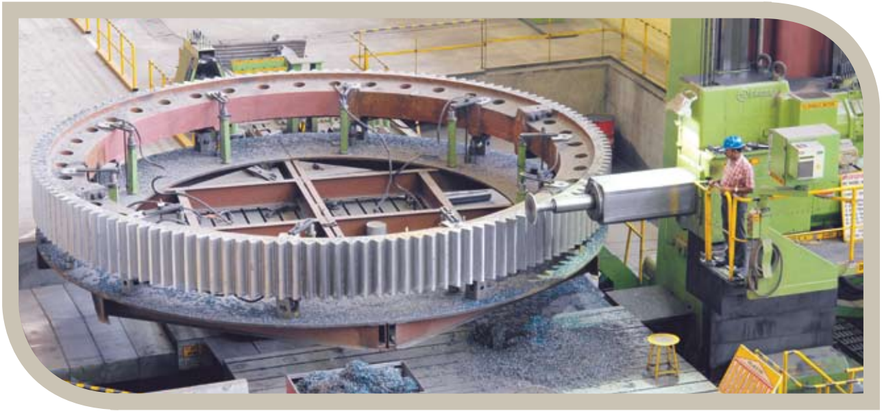
Growth shop at Gamharia, India