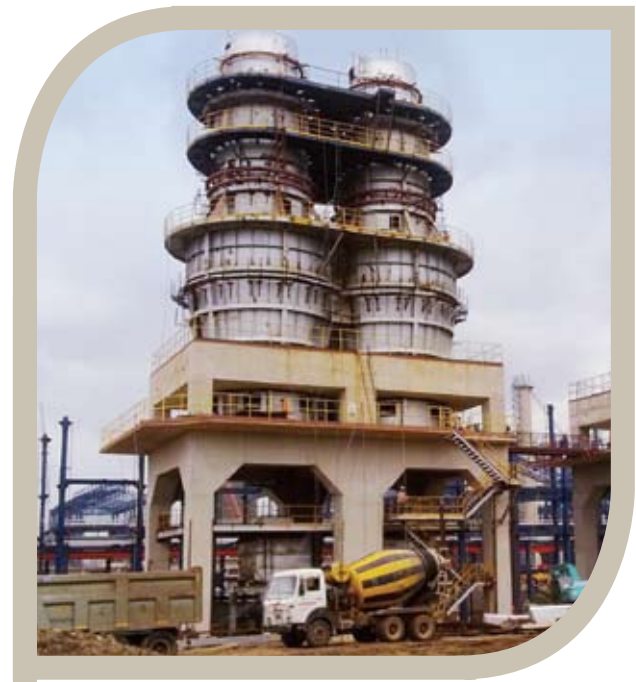
Greenfield project – Kiln 2, Odisha, India

Tata Steel's greenfield project in Odisha is currently under construction. The first phase is likely to go into production by the end of the Financial Year 2014-15.