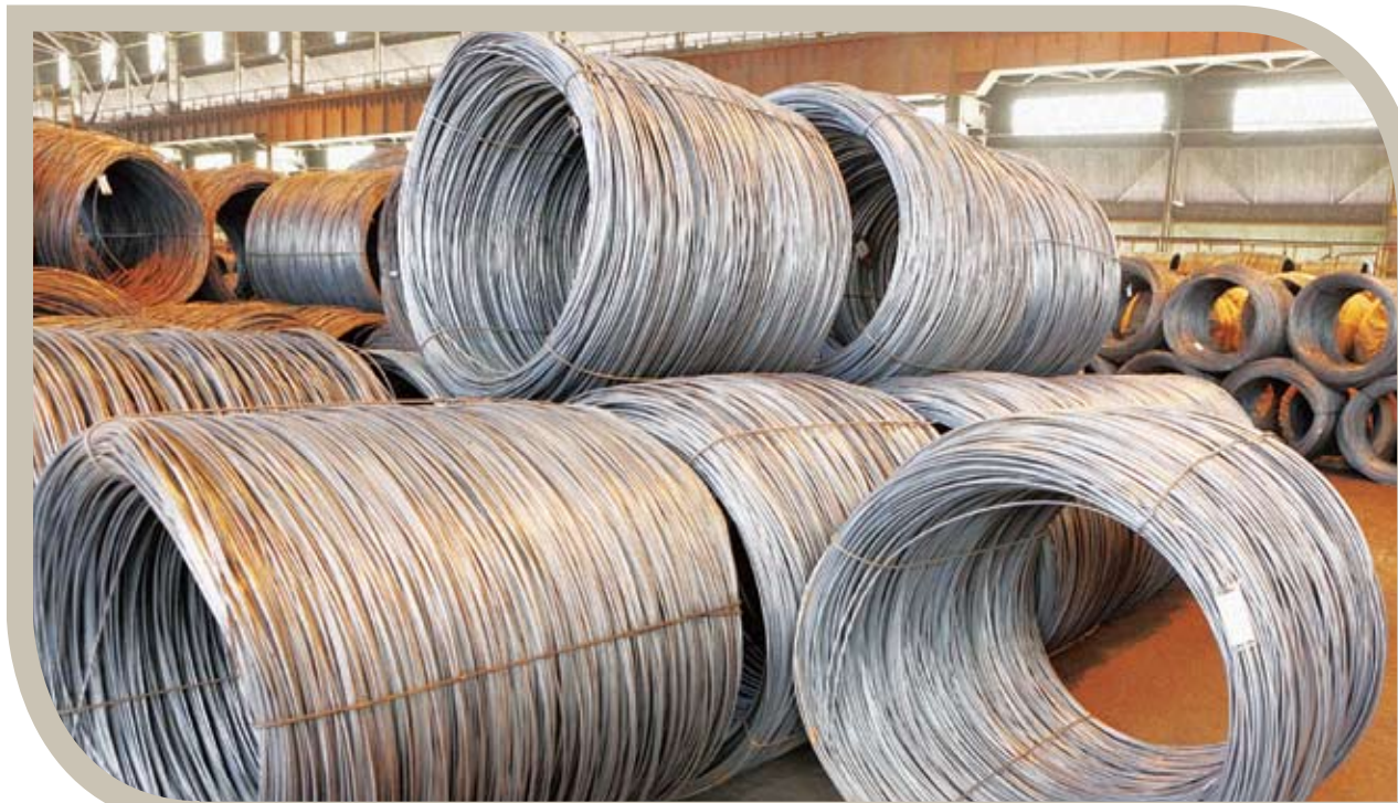
Wires produced in India

TGS provides in-house design and manufacturing capability and contributes to the capital projects of the Company, notably, projects associated with the brownfield expansion at Jamshedpur. The various jobs executed by TGS for the 3 mtpa expansion project are as follows: